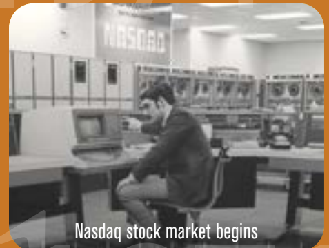
Nasdaq stock market begins