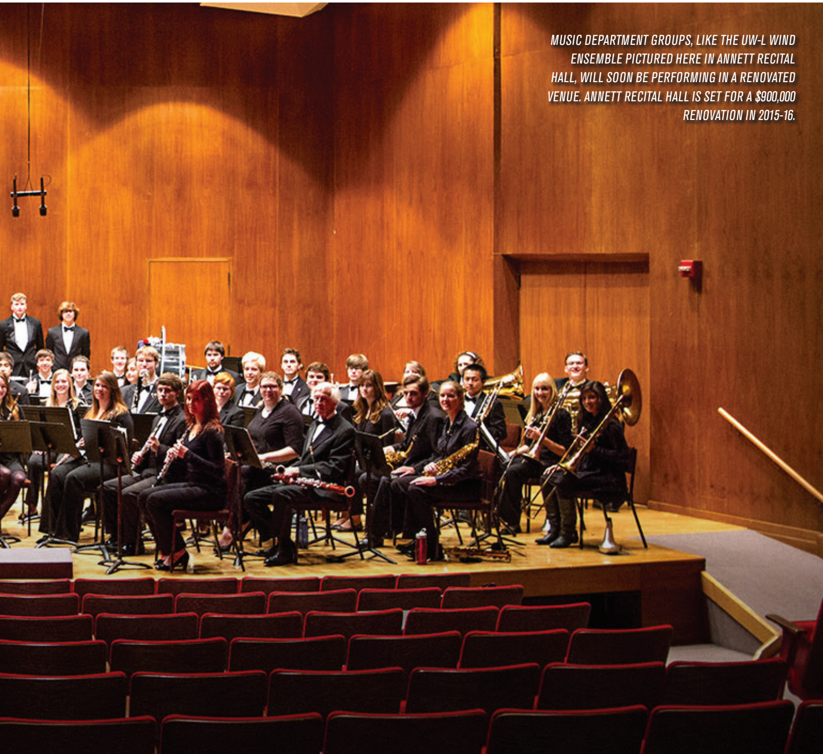
MUSIC DEPARTMENT GROUPS, LIKE THE UW-L WIND ENSEMBLE PICTURED HERE IN ANNETT RECITAL HALL, WILL SOON BE PERFORMING IN A RENOVATED VENUE. ANNETT RECITAL HALL IS SET FOR A $900,000 RENOVATION IN 2015-16.

Planning and design should take place during the 2014-15 fiscal year with renovation in 2015-16. The project will be somewhat similar to the $1.3 million renovation of Graff Main Hall Auditorium completed this summer.