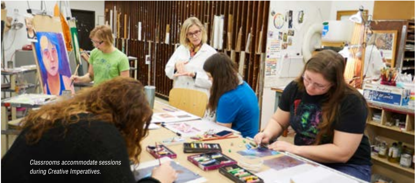
Classrooms accommodate sessions during Creative Imperatives.