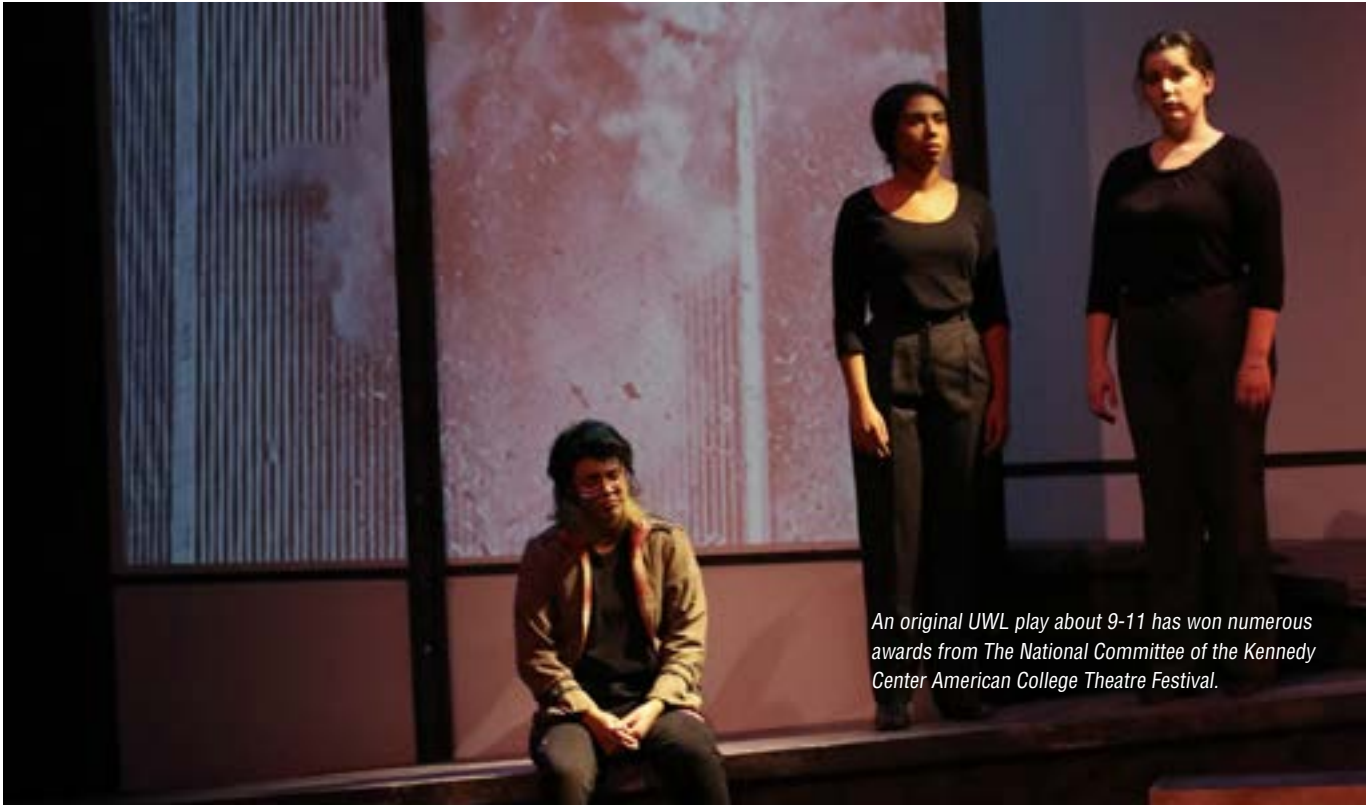
An original UWL play about 9-11 has won numerous awards from The National Committee of the Kennedy Center American College Theatre Festival.