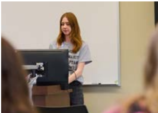
UWL students present information about the university's Campus Thread project, which promotes sustainable fashion to students. They also shared the impact the fashion industry has on the environment worldwide.