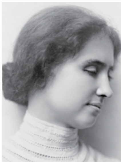
Helen Keller and her longtime caregiver, Anne Sullivan, developed a vaudeville routine in the 1920s to supplement their modest income.