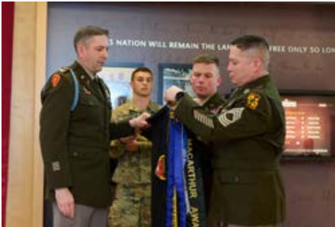
The Eagle Battalion receives a ribbon in recognition of the 2021 MacArthur Award in April. The award is given annually to the best ROTC battalion in the Midwest's Third Brigade, which comprises 42 military science programs in 10 states.