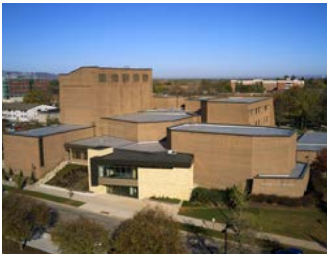
The campus arts building will soon be re-dedicated as the Truman Lowe Center for the Arts.