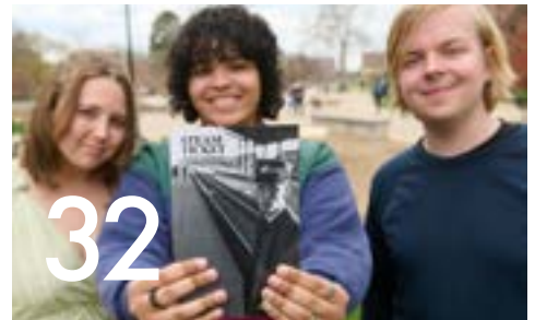
Full steam ahead