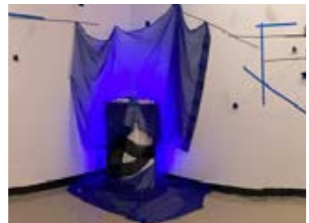
The third floor art gallery holds sessions during Creative Imperatives. This image features work from 2022.

Ältere Garten merges vibrant color, sculpture, imagery, and materials that recall the simplicity of kindergarten to celebrate the fragile beauty of elders in the winter seasons of their lives. At a time in history when elders are physically vulnerable, Iwai asks us to honor the hints of spring in the depths of winter. View it.