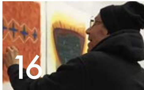
Celebrating a life in art