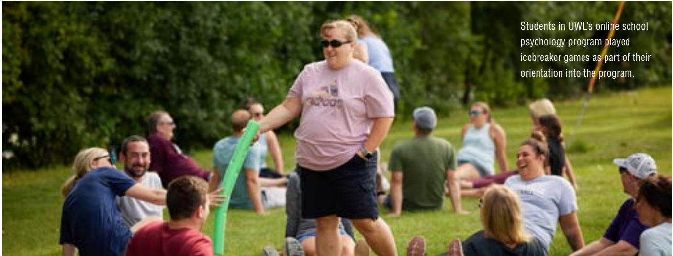
Students in UWL's online school psychology program played icebreaker games as part of their orientation into the program.