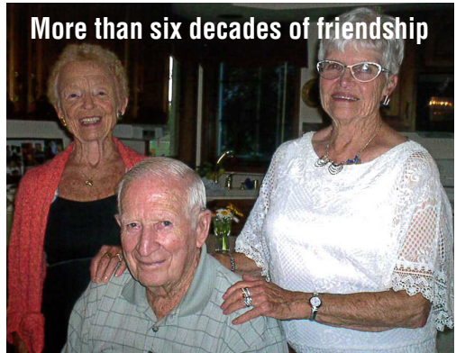
More than six decades of friendship

has moved to Charlotte, North Carolina, where she is a student success coach at Catawba College in Salisbury, North Carolina.