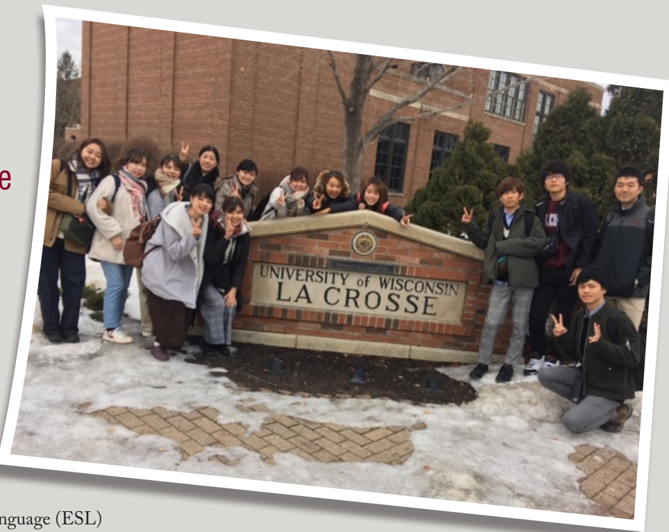
Above Photo: UW-La Crosse's English as a Second Language (ESL) Institute hosted the group of education majors from the University of Teacher Education Fukuoka (UTEF) in Fukuoka, Japan, Feb. 27-March 21.

In addition, the UTEF students visited the UWL Campus Child Center, as well as North Woods International, Logan Middle, Emerson Elementary and 7 Rivers High Schools. The UTEF students observed and participated in lessons — teaching origami, calligraphy, and traditional Japanese dance to La Crosse School District students.