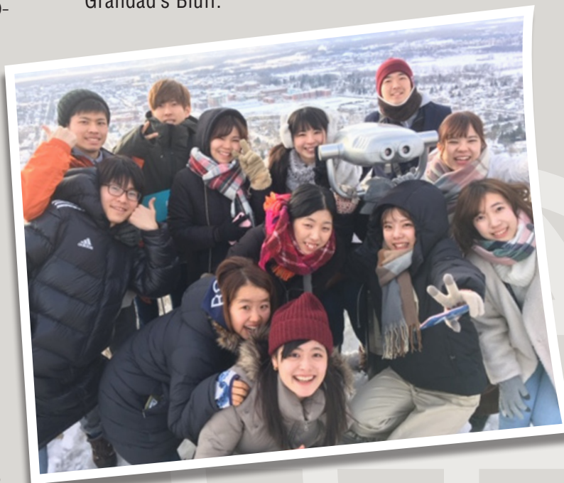
Below Photo: Students from the University of Teacher Education Fukuoka (UTEF) in Fukuoka, Japan visited Grandad's Bluff.