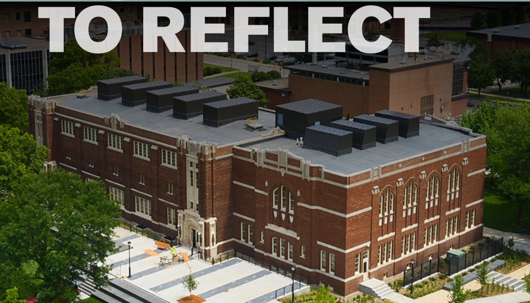
The newly refurbished Wittich Hall is the new home to the College of Business Administration.