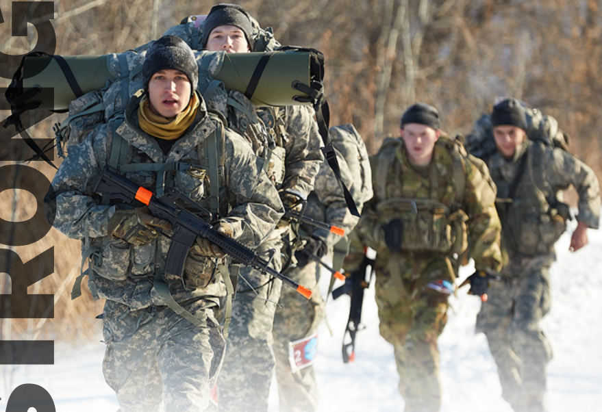
The Eagle Battalion won the annual Northern Warfare Challenge on Grandad Bluff. The winter event tested the endurance and strength of a record 29 teams from throughout the country in February.