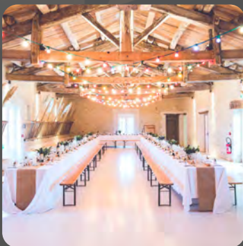
Tourism/Hospitality & Events