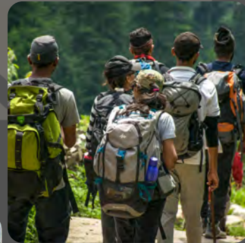
Outdoor Recreation and Camps