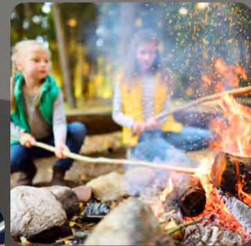
Outdoor Recreation and Camps