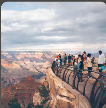
Tourism/Hospitality and Events