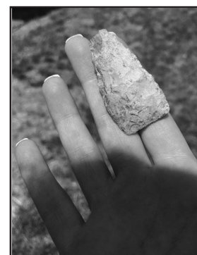
Biface recovered at the Turtle Hill site (47LC866).