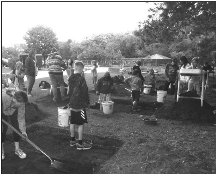
Fourth graders excavating at the Summit School site in May 2019.

Summit Environmental School partnered with MVAC to provide a year-long archaeology program for students during the 2018–2019 school year. In the fall of 2018, students were introduced to archaeology and how early peoples of La Crosse used the area's natural resources in their everyday lives. Under the supervision of MVAC staff, students from grades 2 through 5 shovel tested the school grounds and recovered prehistoric and historic materials. Six excavation units were dug in May 2019, with students involved in all aspects of fieldwork, including digging, mapping, and documenting. The project was spearheaded by third-grade teacher Debra Klaeser, who had participated in several MVAC archaeology classes designed for teachers, with enthusiastic support from school principal Dirk Hunter, and all the teachers and students.