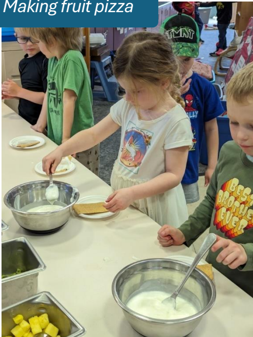
Making fruit pizza